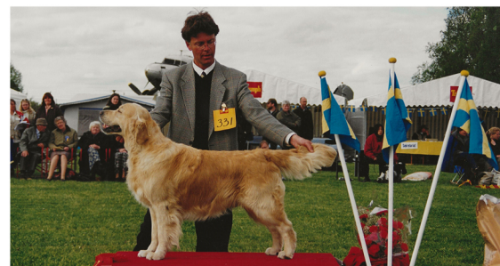
Ch Dewmist Swingin On A Star