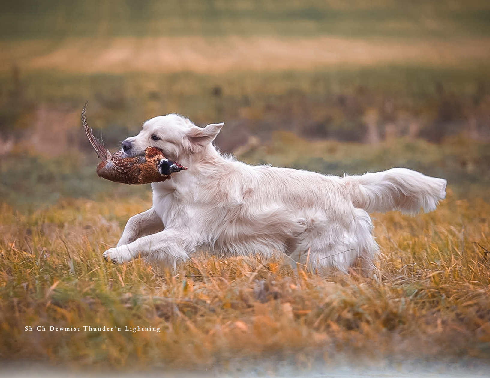
Sh Ch Dewmist Thunder'n Lightning

Since then, I have been a frequent visitor to the English soil but more about this later.