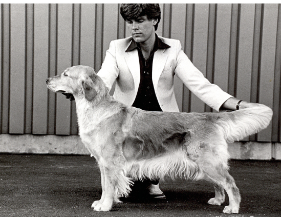
Ch Dainty's Bachelor Girl

At the time I was reading Enid Blyton's books about "The Famous Five" which I loved. The dog in the story was a Golden Retriever named "Tim". After reading those books I knew it was a Golden Retriever I wanted.