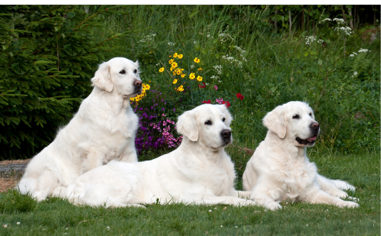
Ch Erinderry Gaelic Minstrel, Ch Dewmist Shaquille & Ch Dewmist Silksilla