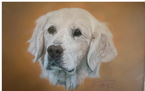
Painted by Artur Walter