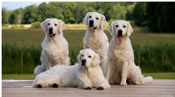
Ch Dewmist Starcadia, Ch Dewmist Star of Africa, Ch Dewmist Glamourizer and lying down Ch Dewmist Silverinda.