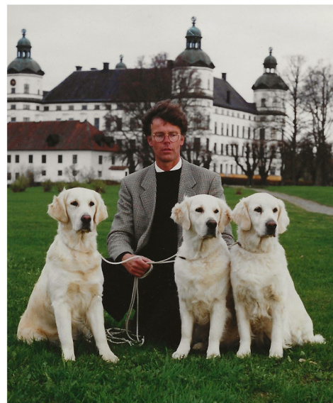
Ch Dewmist Savannah, CH Dewmist Shade of Pale and CH Dewmist Corindabella