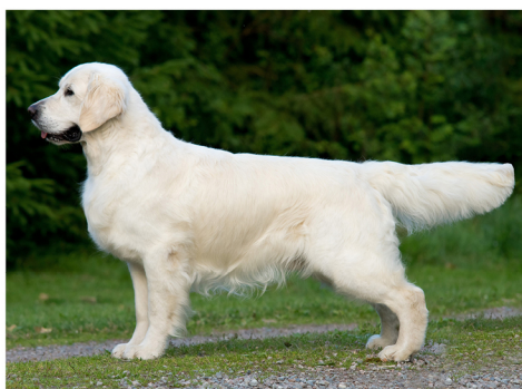
Ch Ralun Versace

I also exported the “Finn” daughter Ch Dewmist Glitterissa to Ireland and the Erinderry kennel where she won her Irish title while I kept Ch Dewmist Glitterinda.