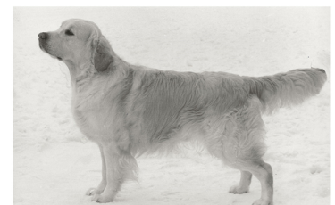
Ch Gyrima Zacharias