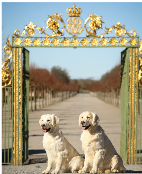
Ch Zampanzar Step In Time and Ch Dewmist Divalicious