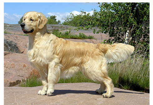
Ch Dewmist Silkventure