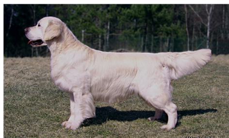
Ch Erinderry Gaelic Minstrel

Silk 'n Satin who produced one of recent years' top winning dogs, Ch Dewmist Sympatico, born in 2012. Another successful sister was Ch Dewmist Silk'n Sequins. Gaelic Minstrel was also the sire of the champions siblings Dewmist Serrano and Serendipity. The brother Ch Dewmist Servantes