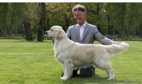
Ch Dewmist Sympatico

I am most honoured to have judged several times in the UK since my first open show back in 1981. I have up to date judged Golden Retriever 10 times with CCs in the UK including bitches at Crufts 2011. The knowledge about various dogs and the development in the breed over the years have been most valuable. This also applies to the other gundog breeds.