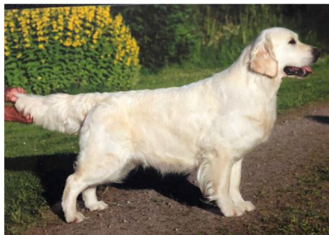
Ch Dewmist Silky Rainbow

Ch Dewmist Silky Rainbow and she has together with the granddaughter Ch Dewmist Rainfall and her newly crowned great granddaughter Ch Dewmist Single Rain carried the line to further successes. The Silky Rainbow sons Ch Dewmist Rainbow Warrior in Belgium and Ch Dewmist Rainbow Quest in Portugal have been successfully used at stud.