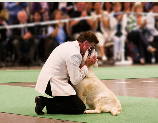
Ch Styal Silksilla