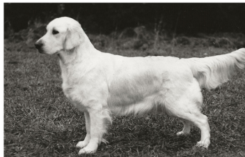
Ch Dewmist Corindabella