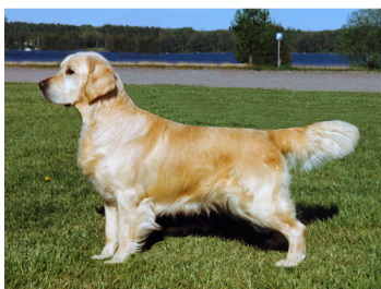
Ch Styal Sheer Scandal