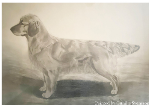
Ch Apports Angelique