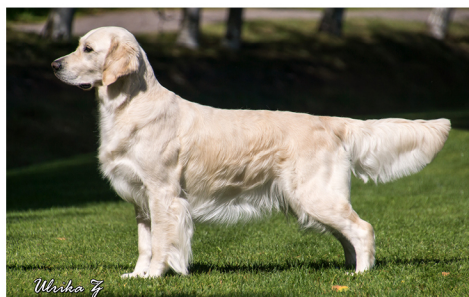
Ch Dewmist Storm From Above