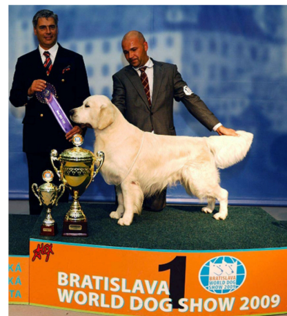
Ch Dewmist Silk Screen

At the Euro show held in Budapest in 2008 Ch Dewmist Silk Screen was BOB with the brother Ch Dewmist Silk Symphony as runner up. Ch Dewmist Leading Lady was BOS.