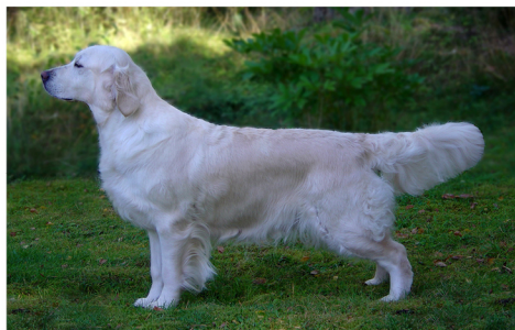
Ch Dewmist Shaquille

His sister Ch Dewmist Savannah and the granddaughter Ch Dewmist Shaquille became very important in my breeding. The next generation saw Ch Dewmist Serenella making her debut in the UK 2004 winning the CC & BOB with