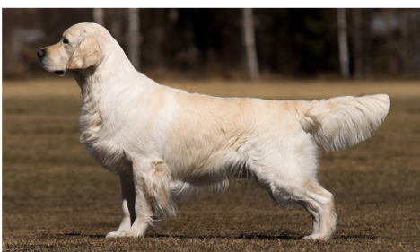
Ch Dewmist Lawrence Of Arabia

When Diversity was going to be bred for the first time, I decided to use the Top stud dog all breeds in the UK. I drove to Wales to use the Spanish import, Sh Ch Zampanzar Say it Again Shardanell. He was a grandson of my Gaelic Minstrel.