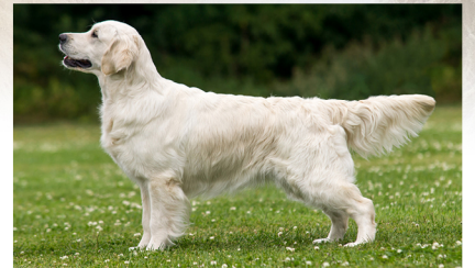
Ch Dewmist Diversity

In Norway Ch Dewmist Double Jeopardy has been a top stud dog and Ch Dewmist Duplicity has kept the flag flying in Finland both as a showgirl and as a brood bitch. Ch Dewmist Dare Devil won his title in Canada. I repeated the mating and I kept Ch Dewmist Delicacy.