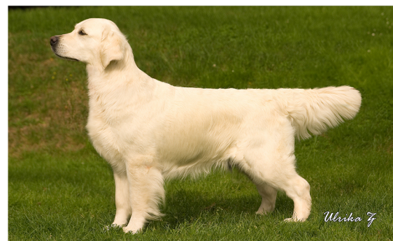
Ch Dewmist Leading Lady

“A lovely bitch who appealed for her lovely typical head and expression, correct length of neck with good shoulder placement, level topline, strong quarters with good turn of stifle. Moved with drive covering the ground well. She was handled and presented to perfection. A real quality golden and I was delighted to give her the CC in a large and quality entry” Anne Falconer - Crufts 2008